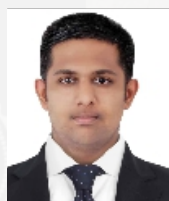
Nambi Narayanan M